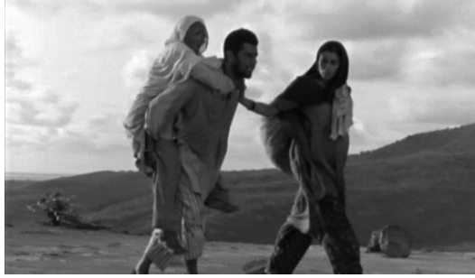
Figure 3.5 The epic journey into exile: Tamas .