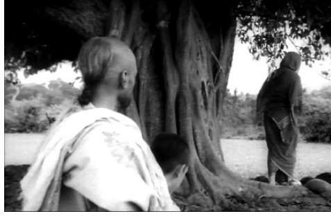
Figure 3.3 The outcast Yamuna in Ghattashraddha .