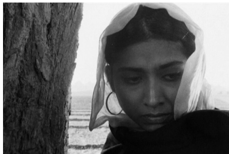
Figure 3.2 Time stands still, Balo waiting in Uski Roti .