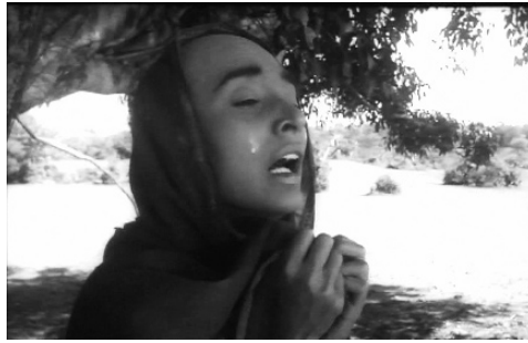
Figure 3.4 Yamuna abandoned by all, Ghattashraddha .

the other hand, confronts directly the consequences of Muslim identity in post-partition India. In the early 1970s, that Garm Hawa goes back to the immediate aftermath of Partition and represents the painful experiences of a Muslim family in Agra under intense pressure to leave for Pakistan is clearly indicative of an attempt to give voice to a repressed history in public discourse, and draw attention to the forces of communalism that had not ended with Partition.